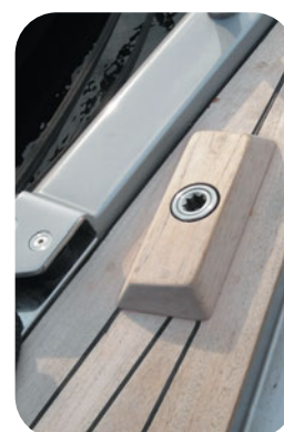
manual backup drive